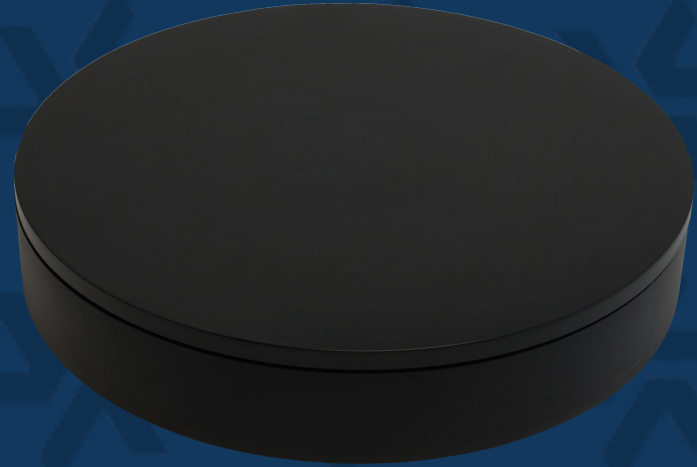
Lightweight Rotary Table