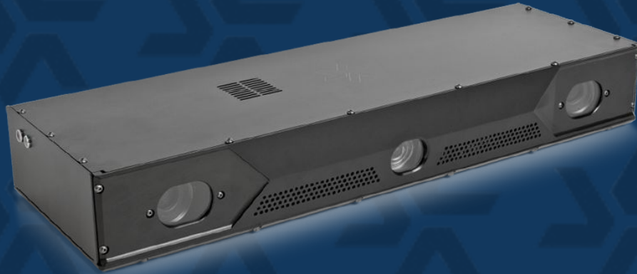
Polyga Compact L6